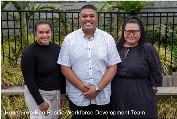
Hanga-Aro-Rau Pacific Workforce Development Team

in Engineering workforce which grew by 50% since Census 2013