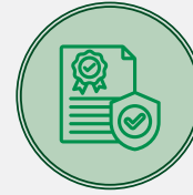
Quality assurance (moderation)